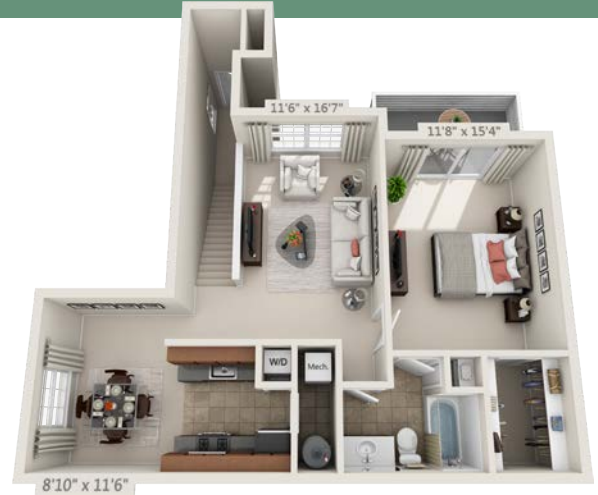
MAPLE II: 1 Bedroom/1 Bath • 862 sq ft

Prices are Subject To Change Equal Housing Opportunity Restrictions Apply.