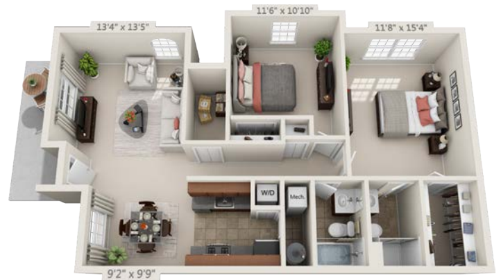
HOLLY: 2 Bedroom/2 Bath • 935 sq ft